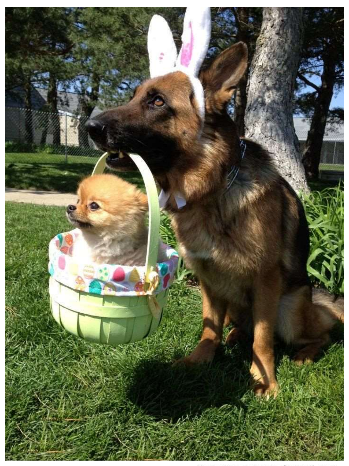
More pics on www.obstacol.com